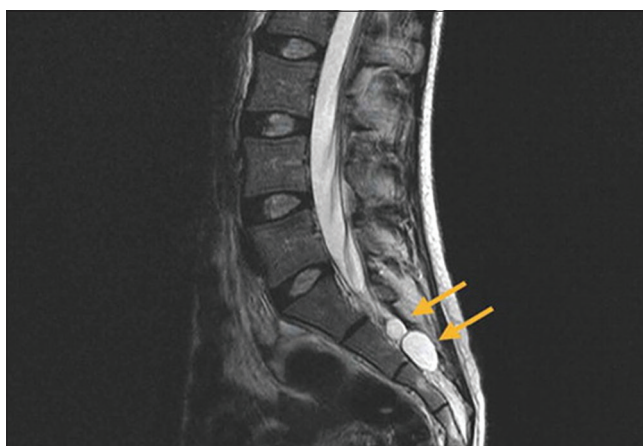
Figure 2. Sagittal T2-weighted magnetic resonance imaging of the lumbosacral spine revealing perineural (Tarlov) cysts (arrows) at the levels of S2 and S3.

inflammatory drugs and local injections of corticosteroids. De Sá recommends the use of pain killers, anti-inflammatory drugs, antidepressants, and physical therapy. Magalhães described a remission of neuropathic pain in a patient with Tarlov cysts in the roots of S1, S2 and S3 after a treatment with Gabapentin in progressive doses to 900 mg once/daily. Other non-surgical therapies include as reported by Paulsen a percutaneous drainage of the cyst under computerized tomography, however, a liquor fistula can happen. The surgical treatment is a sacral laminectomy for a microsurgical fenestration of the cyst. This is then followed by a duroplasty or plication of the cyst wall. According to Caspar, this is a safe and effective treatment (1. De Sá MC, et al, 2008).